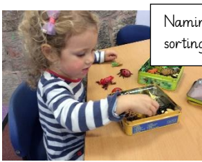
Naming and sorting minibeasts