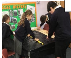
Investigating air resistance