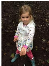
Identifying creatures in the woods.