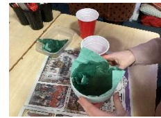
Soluble or insoluble?