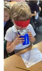
Investigating our senses